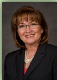
Orange County Mayor Honorable Teresa Jacobs