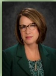
Orange County District 1 Commissioner Betsy VanderLey